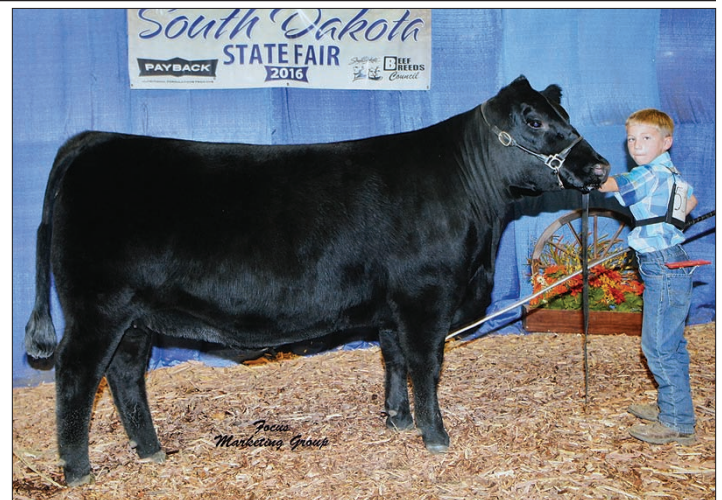
MB Elba 5585 is a maternal sister to Lot 65 by Ultimate Design and was shown at the S.D. State Fair and was Second in Class.

– This is as complete of a bull as we have in the offering. If you got to calve his mother you would undoubtedly want to own this bull. She is a model Angus cow that just goes about her business and gets the job done. This son by International is possibly the best structured bull in the sale. It is really hard to let this bull go.