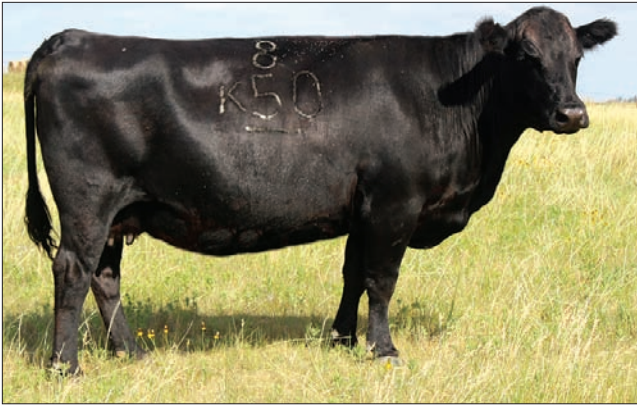
5E Strongland Lass 8k50, the Pathfinder dam to Lot 15.