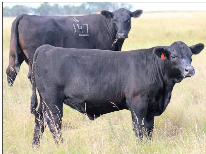
Pre-weaning photo of Lot 44.

- All In is a new sire group for us. They are bigger framed cattle that excel in most carcass traits. These cattle should make nice feeding cattle.