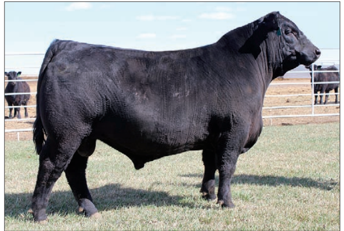
EB Harvester 031 maternal brother to Lots 59 thru 64. He was the high selling bull of the 2015 EB sale.

Lot 62 Tag: M031 Eb Cash M031 +18510153 [OHP] Tattoo: 050 Bull PF50 Birth Date: 01/04/16