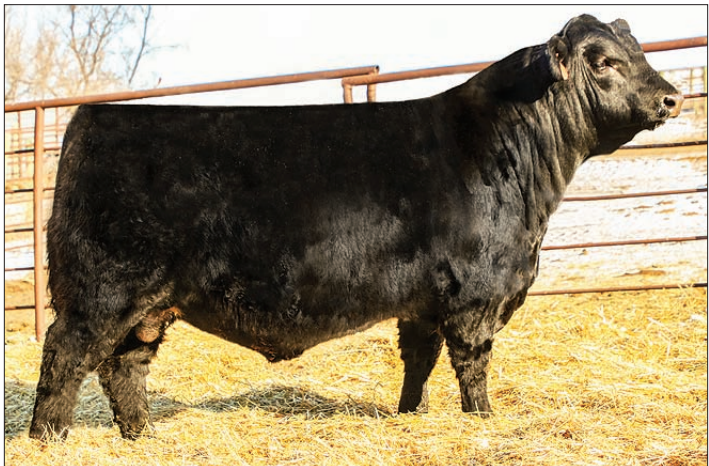
EBD Double Vision 0142 Maternal brother to Lot 25 and the third high selling bull in the 2016 sale.

- One of the largest framed Capitalists in the sale. His maternal brother by Double Vision was the third high seller in the 2016 sale. His mother is a moderate framed cow that packs a lot of punch. She is very fertile and records 5 calves at 364 day calving interval and 94 BR, 103 WR and 107 YR.