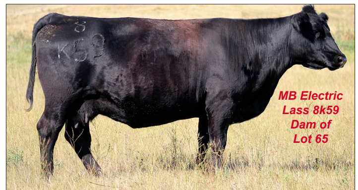
MB Electric Lass 8K59 Dam of Lot 65