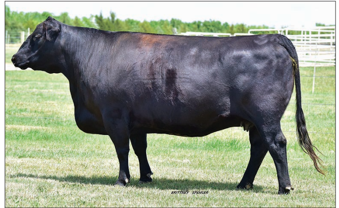
MB Antidote Lass M031 donor dam to Lots 59 thru 64.

Lot 60 Tag: M031 Eb Cash M031 +18510152 [OHP] Tattoo: 0134 Bull PF50 Birth Date: 01/09/16