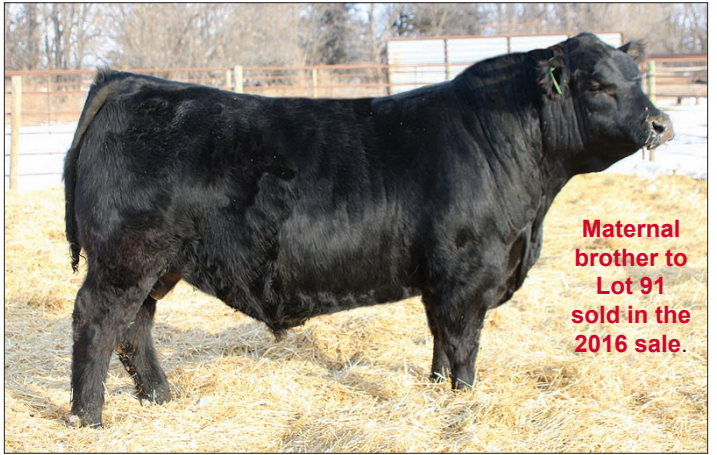
Maternal brother to Lot 91 sold in the 2016 sale.