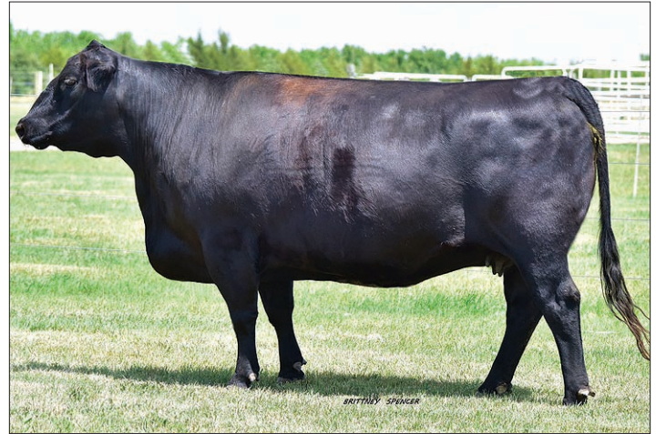
EB R & R 031 maternal brother to Lots 16 & 17. He was the high selling bull at the 2015 EB sale.