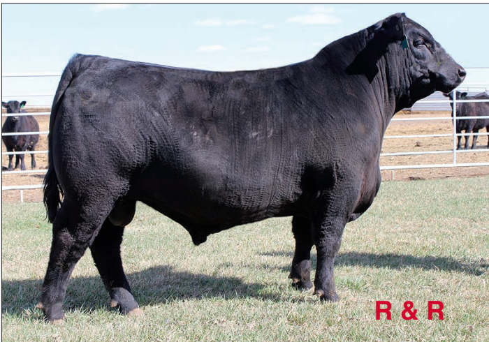
EB R & R 031 Sire of Lot 138.

- A very powerful bull out of a great first calf heifer.