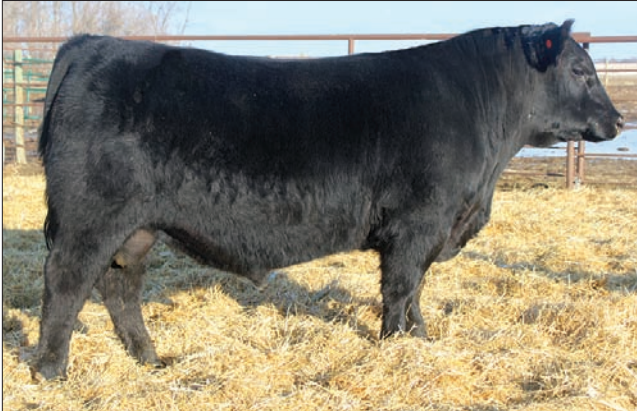
EB Design 850 maternal brother to Lot 15. Sold in the 2016 sale.